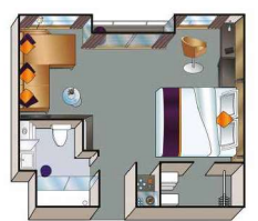
Suite Mozart Deck (284 sf)