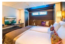
Stateroom Haydn Deck (172 sf)

Notes - Excursions require moderate walking with some stair climbing possible. -Hotel/Ship Check in time in Europe typically begins between 3-4 pm.