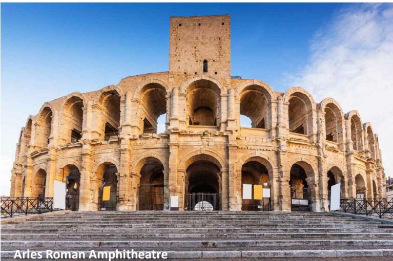
Arles Roman Amphitheatre