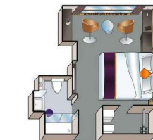
Stateroom Strauss & Mozart Decks (188 sf)